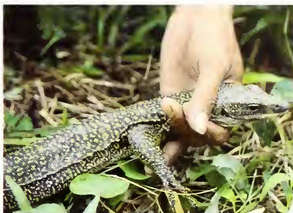
Fig. 14. Varanus sp. from Salibabu Island.

Material examined: MZB Lac. 5176 (AK067), MZB Lac. 5177 (AK064), MZB Lac. 5178 (AK059), MZB Lac. 5179 (AK066), MZB Lac. 5180 (AK065); MZB Lac. 581 (954),